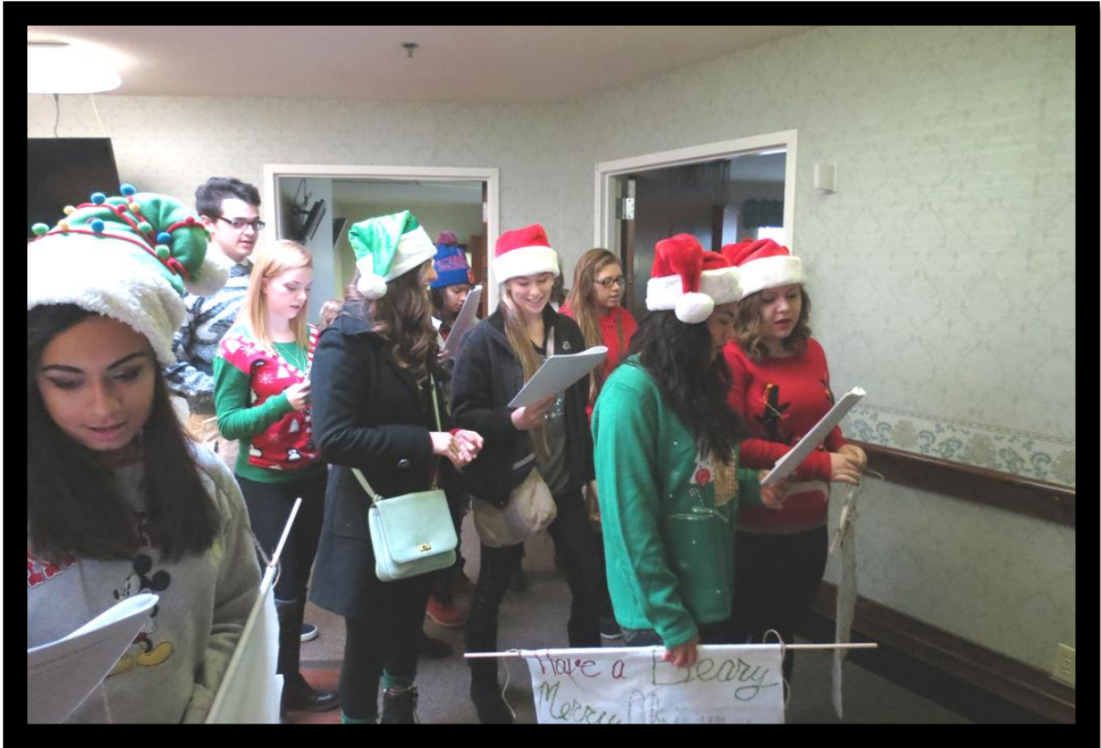
Caroling at Millers Manor